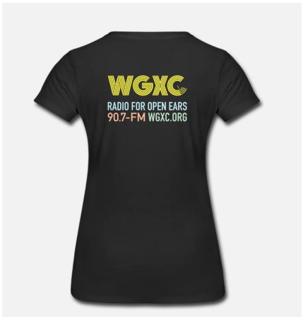
We are thrilled to unveil Rebecca Gray's WGXC T-shirt artwork, selected from last month's open call. The new WGXC: Radio for Open Ears T-shirt is available in black and white in adult sizes and cuts. (Youth sizes by special request.)