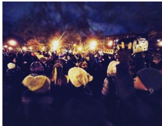
Unsilent Night NYC 2016

Detroit, MI: December 1 Fargo, ND: December 1 Flagstaff, AZ: December 1 Florence, AL: December 1 Knoxville, TN: December 1 Newnan, GA: December 1 Port Jefferson, NY: December 1 Breckenridge, CO: December 2 Seattle, WA: December 2 Winchester, VA: December 2 Norfolk, VA: December 6 Wilmington, DE: December 6 Cambridge, Ontario: December 7 Delaware, OH: December 7 North Adams, MA: December 7 Columbia, MD: December 8 Traverse City, MI: December 8 Malden, MA: December 9 Nacogdoches, TX: December 9 San Francisco, CA: December 9