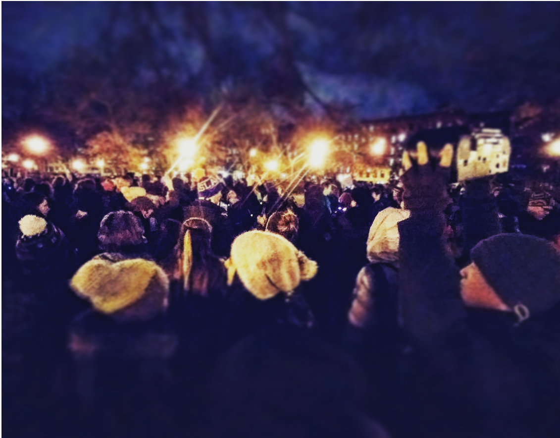
Unsilent Night NYC 2016

If going digital, be sure to pre-download the tracks to your device at www.unsilentnight.com/participate