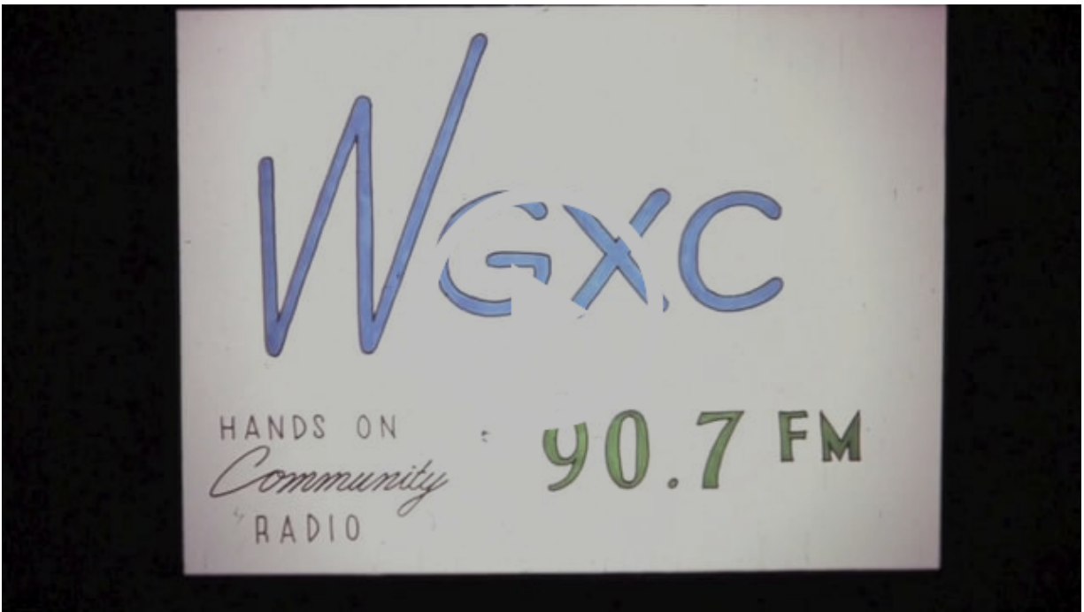
WGXC filmstrip, Brian Dewan (Click image to view filmstrip.)