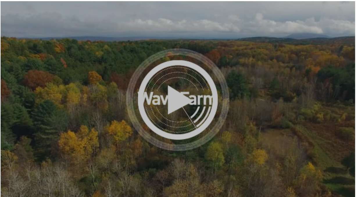
The Grounds of Wave Farm, Melissa Weaver (Click image to view video.)