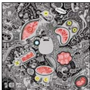
Menomena Friend and Foe

Next Tuesday, January 16, we'll be throwing a listening party at Other Music featuring three anticipated releases which will be hitting store shelves on the following Tuesday. It all gets under way at 6:00 P.M., when we'll put on Clinic's Visitations , followed by the Shin's Winning the Night Away at 7 and Menomena's Friend and Foe at 8. All the while we'll be serving up free pizza and beverages. We hope you can join us!